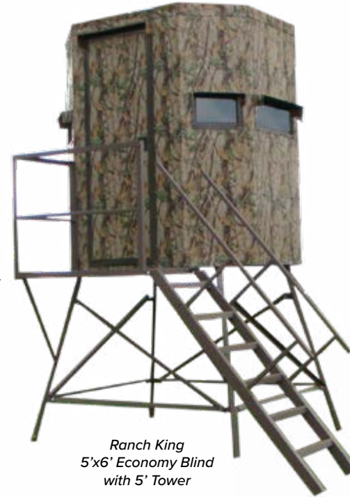
Ranch King 5'x6' Economy Blind with 5' Tower