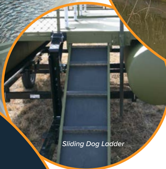
Sliding Dog Ladder