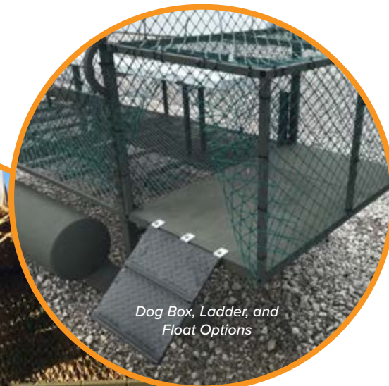
Dog Box, Ladder, and Float Options