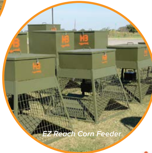
EZ Reach Corn Feeder