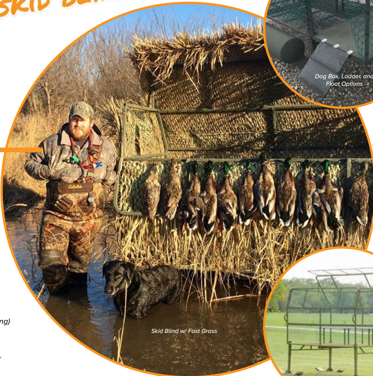
Skid Blind w/ Fast Grass