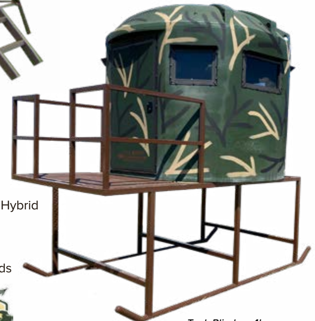
Tank Blind on 4' Skid Platform