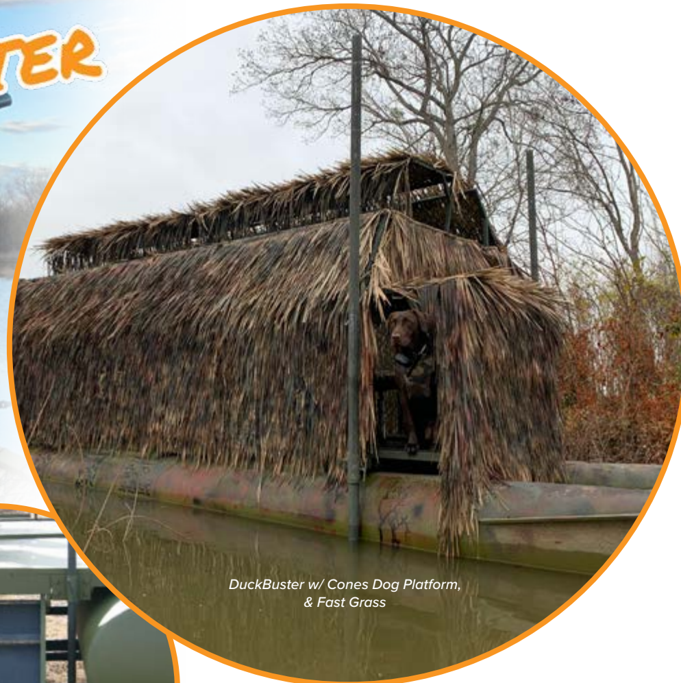
DuckBuster w/ Cones Dog Platform, & Fast Grass

NEVER LET SHOOTING PANELS RUIN YOUR SHOT AGAIN.