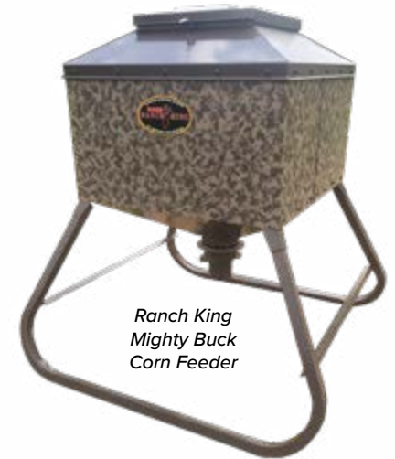
Ranch King Mighty Buck Corn Feeder